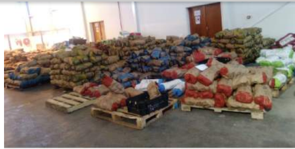
Packaged fresh produce at Maluti Fresh Produce Market. ▲

Farmers in Senqunyane Priority Sub Catchment have found a way out of their struggles and they are now increasing their competitiveness and strengthening their produce of potatoes and cabbage. ReNOKA facilitated the discussions between Ha-Tsi'u farmers and Maluti Fresh Produce Market which subsequently led to an agreement between the two sides which will see the farmers harvest, package and sell directly to the market.