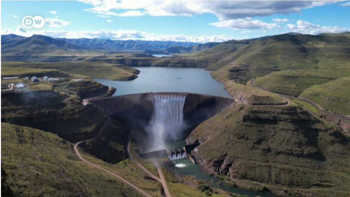
Scene from the Deutsche Welle Documentary about water from Lesotho and ReNOKA efforts to restore catchments

Germany's international TV channel Deutsche Well has included ReNOKA in a TV feature about the state of Lesotho's water.