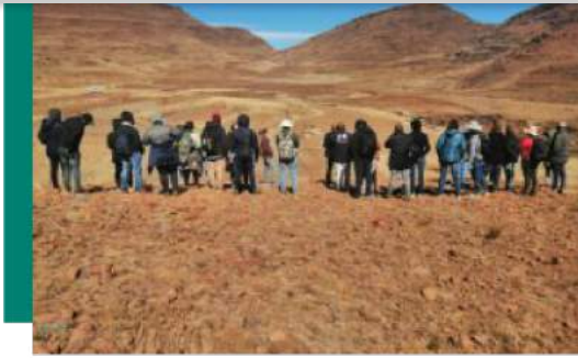
▲ Workshop participants visit the Puete watershed in the Makhalaneng Priority Sub Catchment Area on 18 August 2022.