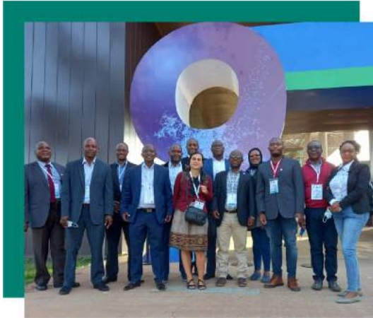
▲ Lesotho government delegates attend the WWF, March 2022.