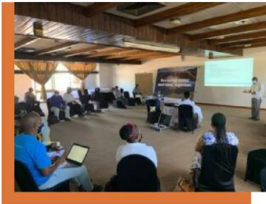
▲ One of the planning meetings where joint activities for all stakeholders were debated and agreed.