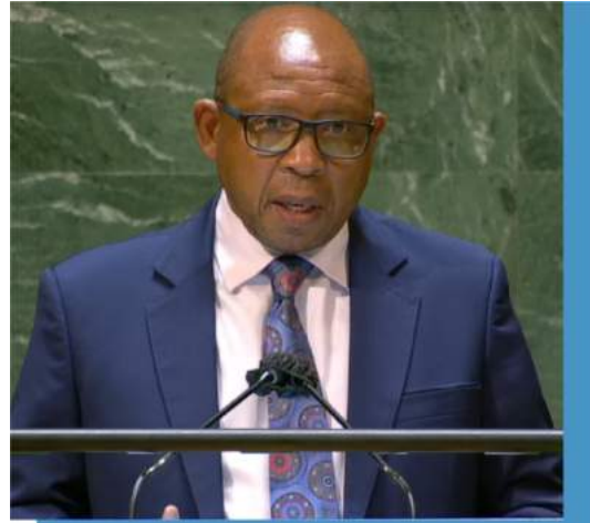
▲ The Right Honourable the Prime Minister, Dr Moeketsi Majoro, speaking on Integrated Catchment Management at the UN, September 2021

World leaders have heard Lesotho Prime Minister, Dr Moeketsi Majoro, link poverty and livelihoods directly to climate change and land degradation, with Integrated Catchment Management cited as a key mitigation measure. Read more.