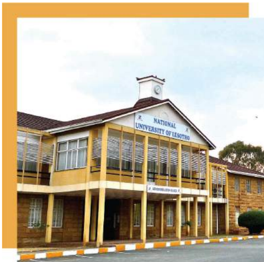
▲ The National University of Lesotho