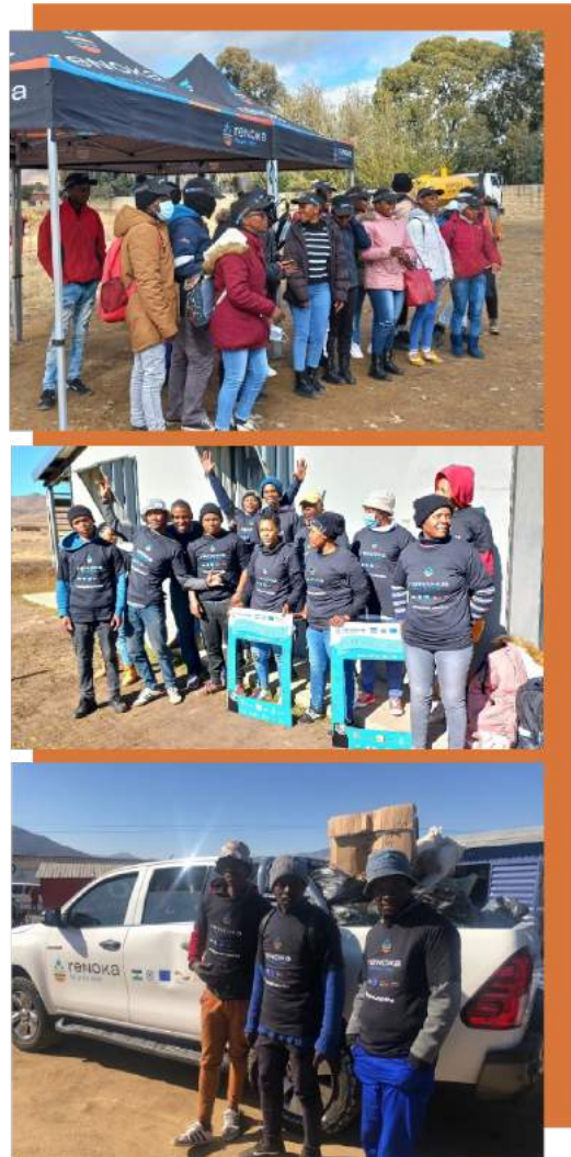
Volunteers in Khubelu, Likheta and Maletsunyane participate in clean-up activities. ▲

Activities took place in the six priority sub-catchments of Hlotse (Hlotse), Khubelu (Mokhotlong), Senqunyane (Thaba Tseka), Makhalaneng (Maseru), Maletsunyane (Semonkong) and Likheta (Mafeteng). The goal of this campaign was to engage 1,000 students and youth, supported by the general public, and collect a total of five tonnes of litter. Read more.