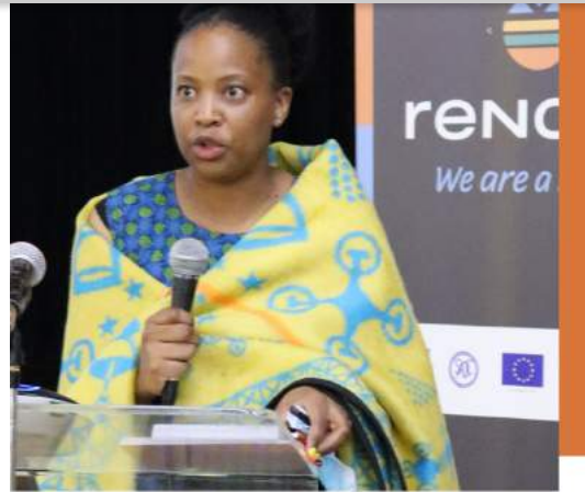
The study was launched at an event in Maseru, March 2022 ▲