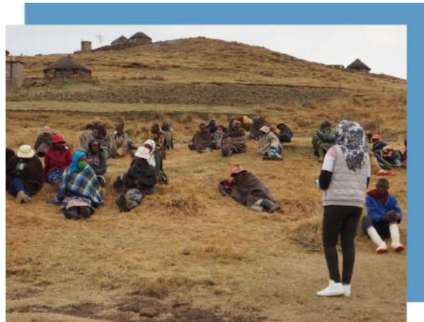
Herders at a meeting with ReNOKA representatives. ▲

Over 80 herders in the Senqunyane Priority Sub-Catchment in Thaba-Tseka have pledged their full commitment and support towards protecting the rangeland areas after participating in range management awareness campaigns at Ha-Dinizulu, Ha-Ts'iu and Ha-Koporala. The discussions with the herders and the community members touched on how improving the rangelands could provide productive land for farming, livestock and foraging.