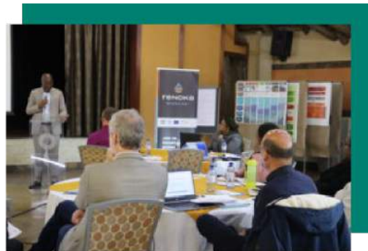
Various stakeholders pictured at the project inception workshop in Thaba-Bosiu on 25 August 2022. ▲