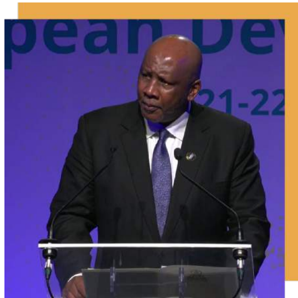
▲ His Majesty, King Letsie III, speaks during the Opening Ceremony of EDD, June 2022.

His Majesty, King Letsie III of Lesotho, delivered a speech during the high-profile Opening Ceremony, which was attended by various dignitaries including the Heads of State for Ghana, Mauritania, Cabo Verde, Namibia, Belize and the Republic of Congo. During the event, keynote addresses were made outlining various perspectives on the role of the EU Global Gateway in international and domestic contexts. His Majesty's full speech can be viewed here .