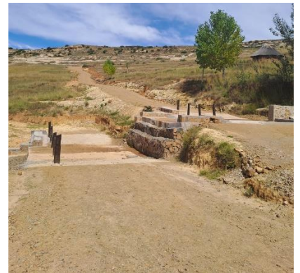
Ha Khabo road rehabilitation

Disclaimer: This publication was produced with the financial support of the European Union (EU) and the German Federal Ministry for Economic Cooperation and Development (BMZ). Its contents are the sole responsibility of the Integrated Catchment Management Unit and do not necessarily reflect the views of the European Union or the German Federal Ministry for Economic Cooperation and Development (BMZ)