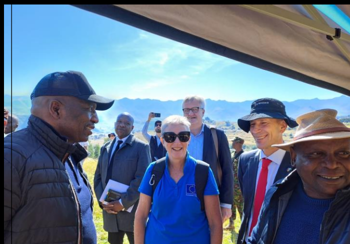
From left: Prime Minister, EU and German Ambassadors