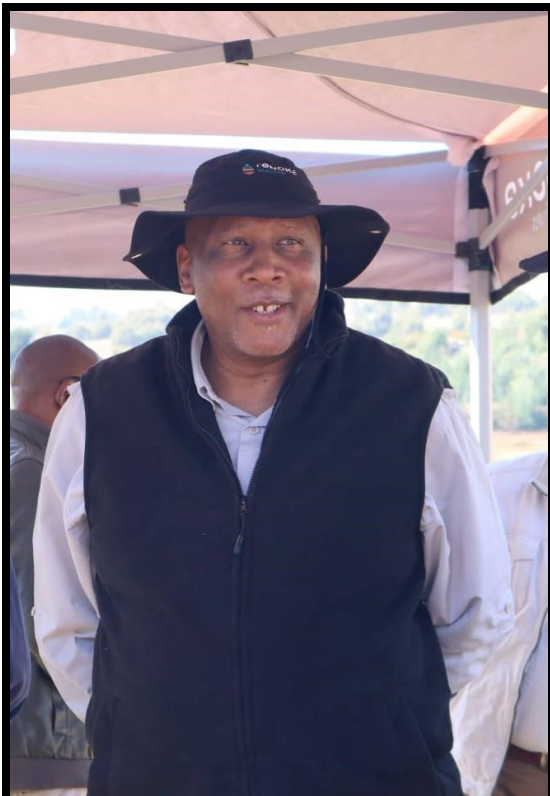
His Majesty King Letsie III

"Today I have seen and I have heard from the members of the community that they appreciate the positive impact that ReNOKA has brought in their livelihoods". On the photo below is His Majesty assessing the stone lines that have been put in place to slow down water runoff and decrease the rate of soil erosion