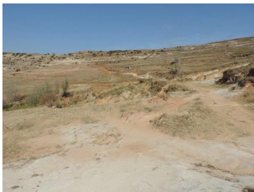
Before construction of the road