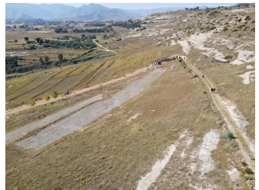
Two months after installation