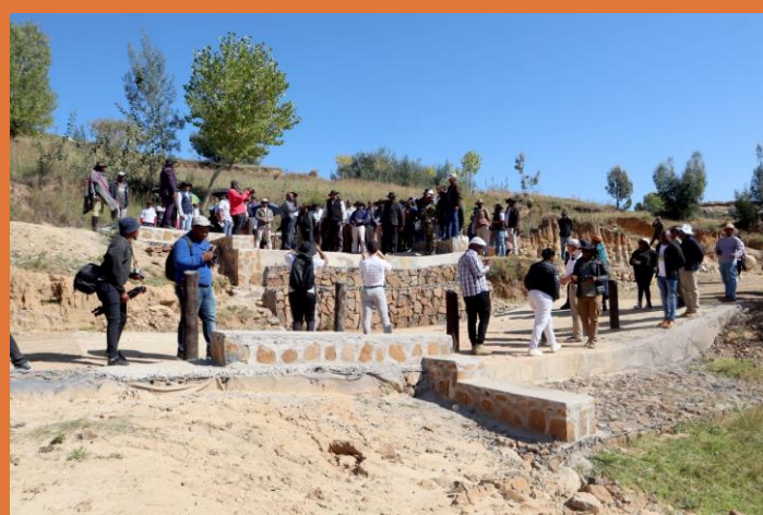
His Majesty being briefed about drifts and gabions

As a measure to curb soil erosion, the silt traps have been set in place by the roadside drains to reduce the speed of water runoff and trap silt, thus reducing soil erosion. Erosion blankets have also been placed in one of the local fields to encourage vegetation growth. Now with time, the erosion blankets will decompose, thereby fertilizing the soil and improving vegetation in that area. This then encourages an improved food production.