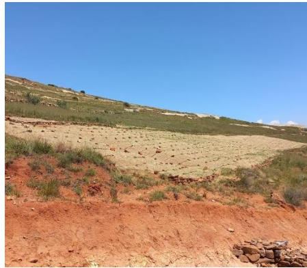
Treatment with erosion blankets