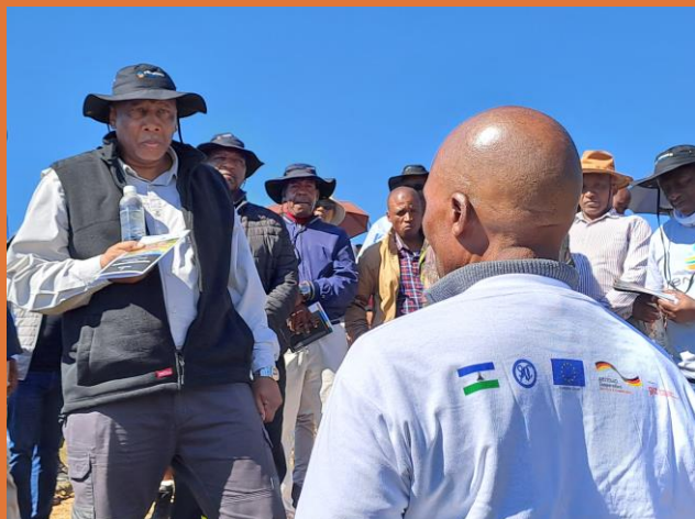
His Majesty interacts with the community

Ha Khabo, located in the Upper Mohokare catchment area (Hlotse priority sub-catchment), is one of the hotspot areas which were identified under ReNOKA in 2020 as the immediate areas that needed intervention. This is a very arable land with plenty of wetlands which are the source of Hlotse River. However, the rate of degradation around this area is threatening the livelihoods of the communities, with high soil erosion leading to gullies. The area covers about 35 821 hectares and within it, there are community watershed teams from 13 villages.