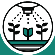
Taolele tsosoloso ea likhakeletsi

Ntlafatso ea mekhoabo ka hoho nka bohato bo potlatileng ba tsosoloso le phethahatso ea meralo ea taolo ea likhakeletsi tsa metsi. Meralo ena e rarolla mathata a bakiloeng ke litloaello tse mpe tsa tšebeliso ea mobu, e thusa ho ba le maemo a leholimo a amohelang le ho fana ka menyetla ea ho phelisa malapa sechabeng.