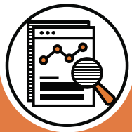
Lipatlisiso le pokello ea lintlha

Taolo ea tšenyeha ea likhakeletsi tsa metsi e itšetlehile holima kutloisiso ea sechaba le litloaello tse nepahetseng tsa tšebeliso ea metsi. Sena se fihleloa ka phatlatso ea melaetsa e hlakileng molemong oa ho fetola kutloisiso le litloaello tse mpe tsa sechaba.