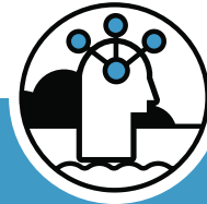
Litsebo le koetliso ea basebetsi

Meralo e nepahetseng ea kabo ea lichelete molemong oa ho etsa bonnete ba hore chelete e lula e le teng bakeng la phethahatso ea meralo ea ntlafatso le tsosoloso ea likhakeletsi tsa metsi ke makala le litsi tsa ‘muso. Ho hohela bo-ramatsete ba machaba le litsi tse ikemetseng ho tlatsetsa letloleng la naha.