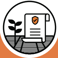
Khaho ea leano la tsamaiso ea litsi tsa phethahatso

Ntlafatso ea mekhoabo ka hoho nka bohato bo potlatileng ba tsosoloso le phethahatso ea meralo ea taolo ea likhakeletsi tsa metsi. Meralo ena e rarolla mathata a bakiloeng ke litloaello tse mpe tsa tšebeliso ea mobu, e thusa ho ba le maemo a leholimo a amohelang le ho fana ka menyetla ea ho phelisa malapa sechabeng.