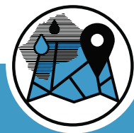
Tšebeliso-’moho ea mebuso le linaha

Litla-morao tsa pheto-phetoho ea boemo ba leholimo Lesotho li bonahala ka pula ea matlopo-tlopo le likoluo tse kang likhohola, komello le mocheso. ReNOKA e ipapisitse le mekhoe-tšebetso e elang hloko likotsi tse teng molemong oa taolo ea likhakeletsi tsa metsi tse mamellang maemo a leholimo. E ipapisitse le litharollo tsa tlhaho tse thusang ho ikamahanya le pheto-phetoho ea leholimo.