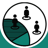
Phatlatso ea melaetsa ho fetola litloaello tsa sechaba

Ho netefatsa hore litsebi le batho bohle ba taolong ea lichelete le lisebelisoa ba na le litsebo tseo ba li hlohang ho fihlela talolo ea moshoelella ea mobu, metsi le tikoloho. Litsebo e ka ba phano ea lithupelo tse batsi mabapi le mekhoe ea temo ea moshelella kapa thuto-bohlo e amanang le temo ka Sekolong se Sehlole sa Sechaba, Lesotho.