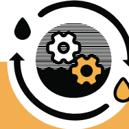
Tikoloho e Mamellang Maemo a Leholimo

Pokello ea lintlha molemong oa ho etsa liqeto tse ipapisitseng le lipatlisiso, liphuputso le boqapi taolong ea khohola-koqo ea likhakeletsi. Lintlha tse nepahetseng li thusa ho theha maano le mekhoe-tšebetso e nepahetseng molemong oa kabo le tšebeliso e nepahetseng ea lichelete libakeng le lichabeng tse atlehang ho phethahatsa maano ea taolo le tsosoloso ea likhakeletsi tsa metsi.